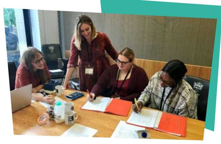
Young women peer researchers during research workshops at the Guildhall, London.

It affects my sleep – I'm constantly on edge, I have to check mum has medication, my brother is not leaving the house or bringing friends round. My family have to be straight, I check on them all including my baby before I sleep."