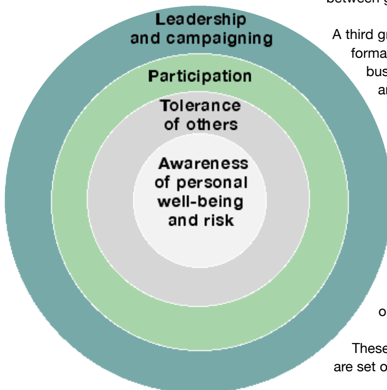
Figure 1: The content of projects for young people

These four levels of programme content are set out in Figure 1.